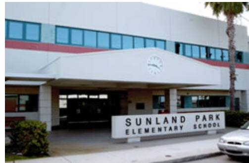
On the South Side of Sunrise Blvd., Immediately East of Joseph Carter Park.