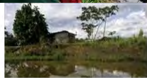
Chevron Fined $8B for Ecuador Pollution